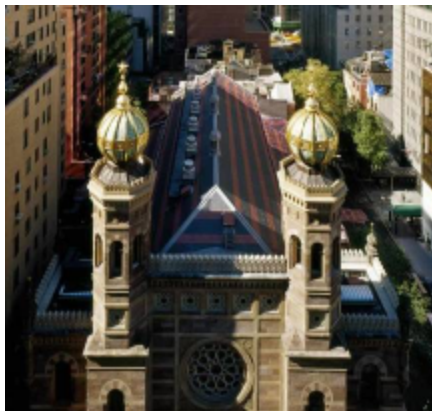
After the restoration