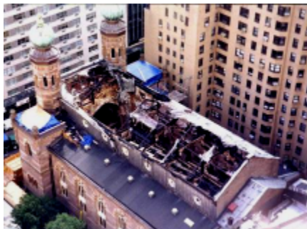
Central Synagogue before the restoration

This project was awarded The National Trust for Historic Preservation's National Preservation Honor Award , New York Construction News' 2001 Restoration Project of the Year , the Preservation League of New York State's Project Excellence Award and the Lucy G. Moses Preservation Award for 2001.