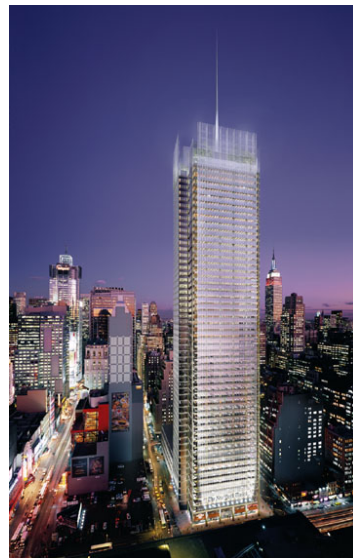
Figure 1. The New York Times Building, looking east.

For this project, two user groups are involved: journalists and other New York Times newspaper staff in the lower half of the building, and general office tenants in the upper half. The New York Times Company wants a headquarters building that befits its position in the media industry, in the city, and in the world. The Times also has a long-term perspective; it has occupied its current building for a century. Its partner in creating this project, Forest City Ratner Companies, is a developer of office space familiar with local market needs and the financial requirements for a viable building operation. The design side has its own pairing: the Renzo Piano Building Workshop has created cutting-edge architecture in Europe and around the world, and FXFowle Architects has designed beautiful and innovative buildings in New York and many other cities.