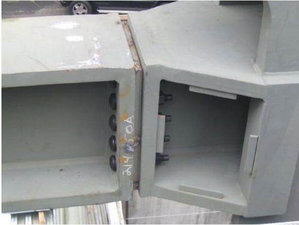
Figure 4. Bolted connection at exposed compression shut.

adjustability that meets the architect's aesthetic requirements. Strut ends join fabricated knuckles on columns through field-bolted end plates with provisions for shims at gaps. The knuckles are then boxed in with field-welded closure plates [Figure 4].