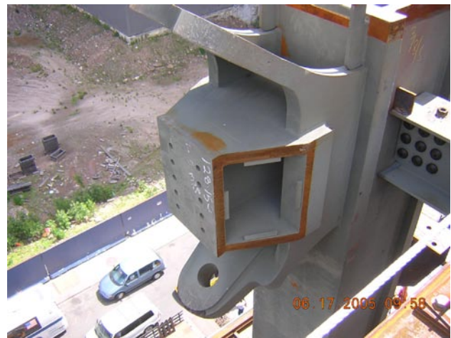
Figure 3. Plates at exposed knuckle connection.

would significantly increase steel tonnage, adding to project cost. The upper exposed columns would also act at much low stresses than upper interior columns, causing differential shortening that compromises floor levelness. Instead the sizes vary with building height at regular intervals. For example, exposed columns are built-up steel plate boxes with 30-by-30-inch outside dimensions and web plates slightly inset so flange tips ‘read.’ Flange thickness varies from 4 to 3.5, 3, 2.5 and 2 inches. X-bracing rod diameters closely follow the flange thickness on that floor, and beam flange thickness is \frac{1}{2} of the adjacent column flange thickness. The locations of size change suit both structural and architectural needs. Where beam or column properties must change between these steps, the thickness of web plates is varied since webs have no architectural impact.