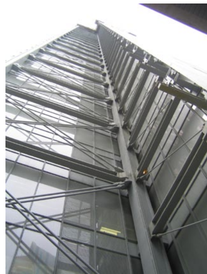
Figure 2. Perimeter notch with exposed steel.

Elevators also affect east-west bracing. With a broader wind face and a narrower core dimension, four lines of bracing were initially considered to meet wind drift and comfort requirements. However, service cabs with reverse facing doors would require crossing one of the four bracing lines, rendering it less effective. The solution, X-braced bays in the perimeter notches that work in tandem with the core, brought their own architectural and structural challenges [Figure 2].